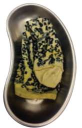
A very expensive sock that was removed from the intestines of a dog

So – as well as trying to ensure your pets don't eat these objects, we strongly recommend pet insurance to cover you against these unexpected eventualities!