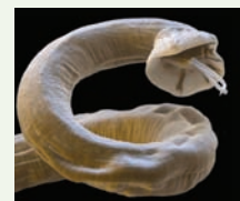
Electron micrograph of an adult lungworm

Once swallowed, the larvae migrate to the heart where they will develop into adult